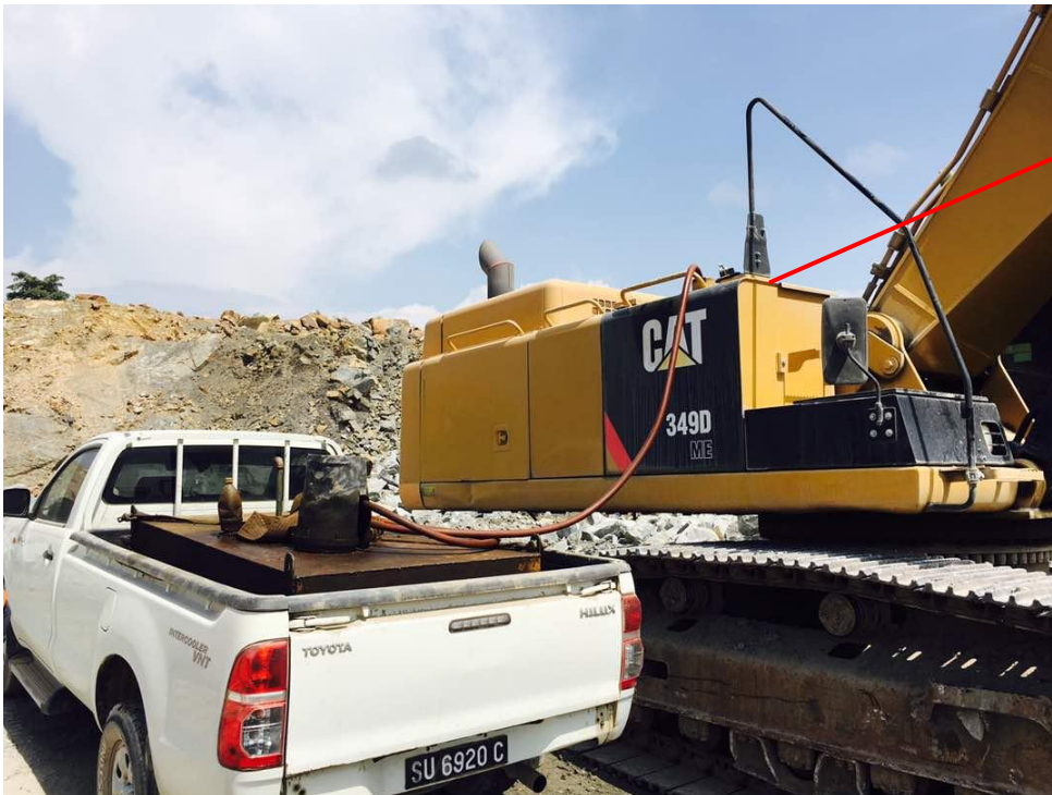
During Refueling- from rusty tank and exposed to weather