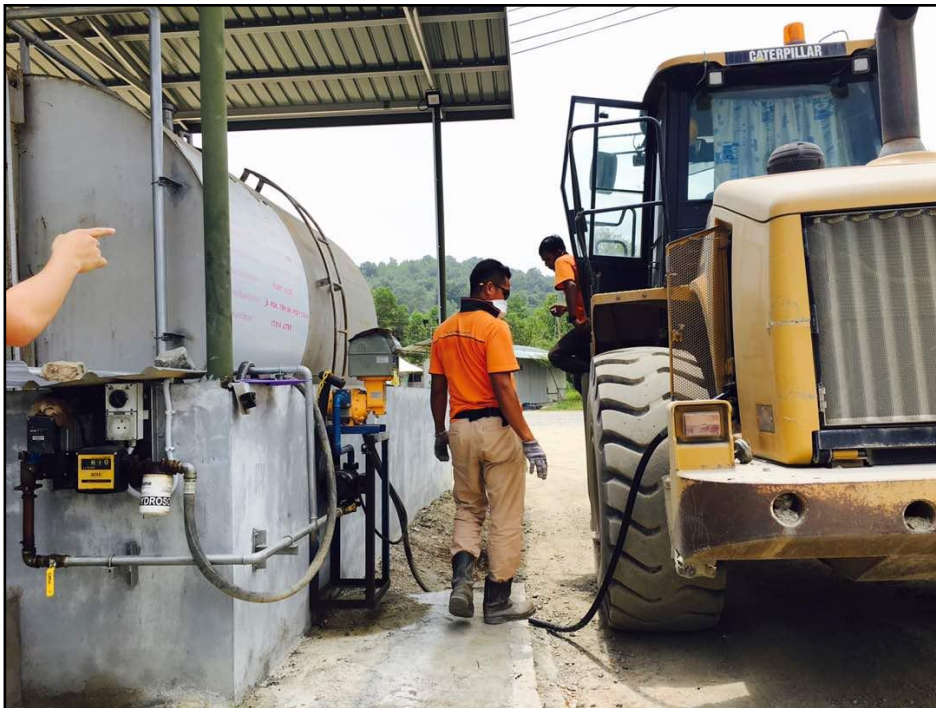
During Refueling- exposed to weather